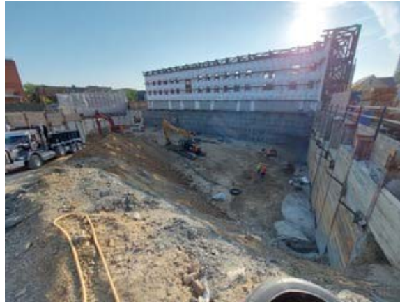
The excavation phase is almost complete!

LPRO is also collaborating with our neighbouring resident group south of Roselawn, Eglinton Park Residents Association (EPRA), who are the community representatives for the 2400 Yonge Construction Hub (between Roselawn and Montgomery). That site, along with the upcoming 500 Duplex and 34 Montgomery (a proposed development on Montgomery between Yonge and Duplex), means ongoing construction in our area for the next several years. LPRO and EPRA are working to give a voice to local residents who are most affected and press for solutions to their concerns.