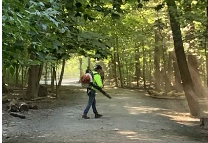
Gas-powered leaf blower creating ear-splitting noise, and spreading fumes and fine particulate matter in a park, summer 2021.